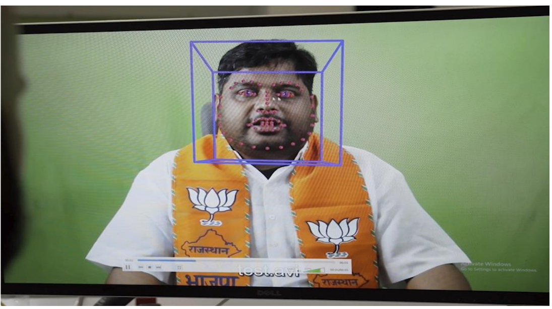
Scanning of Facial Features – The Indian Deepfaker