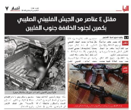
ISIS-EA attack claim published in Al-Naba 435