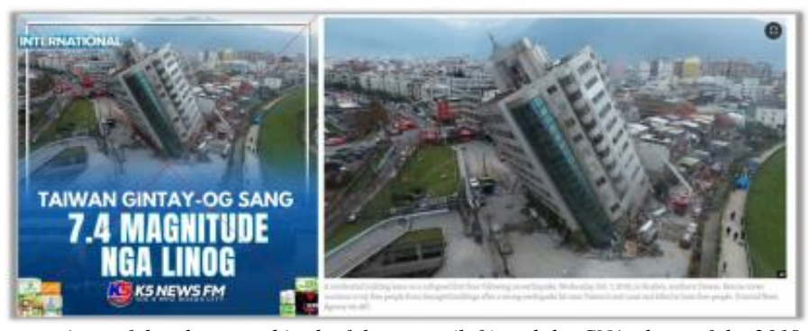
Screenshot comparison of the photo used in the false posts (left) and the CNA photo of the 2018 quake (right)