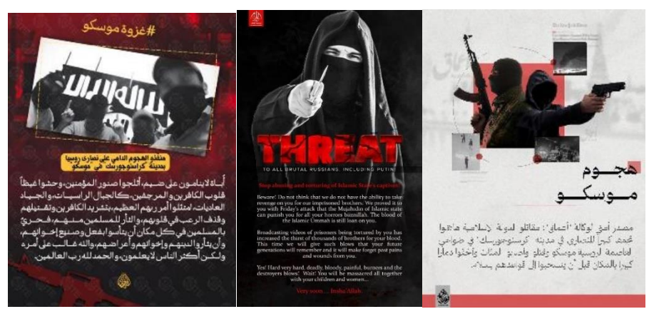
Examples of posters referencing the 22 Mar 2024 Moscow attack

6. Pro-ISIS media groups launched a coordinated propaganda poster campaign between 22 to 26 March 2024 celebrating the attack, inciting similar lone-wolf attacks and framing the attack as retribution for Russia's military activities against ISIS in Syria.