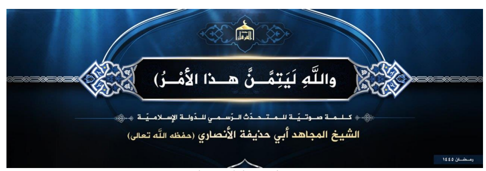
Banner Photo of the Audio Statement