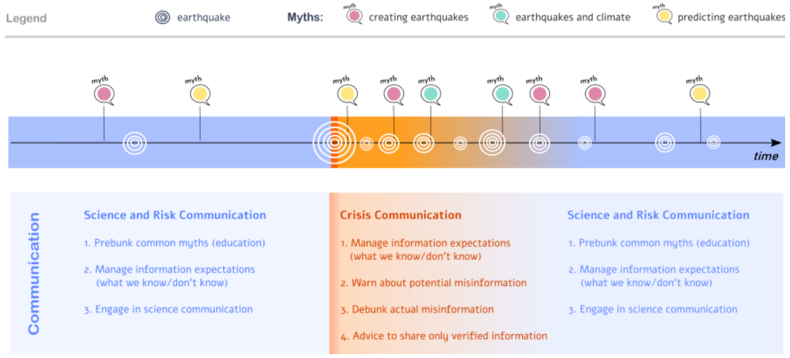
Communication timeline and strategies, based on an example of misinformation spread during an earthquake.

4. Governments may work with social media platforms like Facebook and X to debunk fake news during crises. For instance, the Anti-Fake News Center in Vietnam was set up to counter fake news during times of peace and crisis. In addition, by tapping onto independent fact-checking organisations, countries can instill accountability in social media platforms to uphold information accuracy during crises. By adopting some of these best practices, governments can be better prepared for crisis communication when natural disasters hit, and more rapidly restore peace and stability within the nation in disaster recovery efforts.