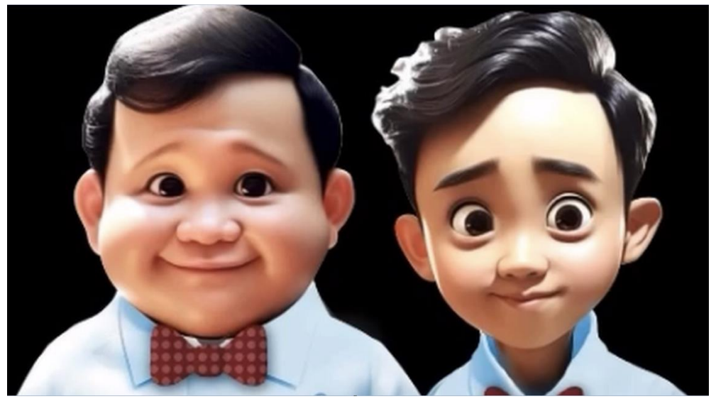
Gen AI created Prabowo-Gibran avatars used during Indonesian elections in February 2024

6. With emerging technologies providing new opportunities to shape how elections are run, tech-savvy politicians or those well-resourced with strong social media teams can leverage Gen AI to up their elections game, and gain an edge over their political rivals. As the world approaches the many elections in the months ahead in 2024, it remains to be seen how these emerging technologies will be used. Information practitioners in the government sectors, big tech players and social media platforms will play crucial roles in enabling creativity and freedom of speech, while preserving information integrity during elections.